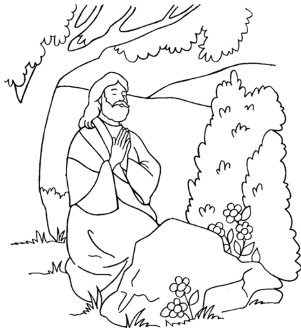
Jesus Prays for His Disciples